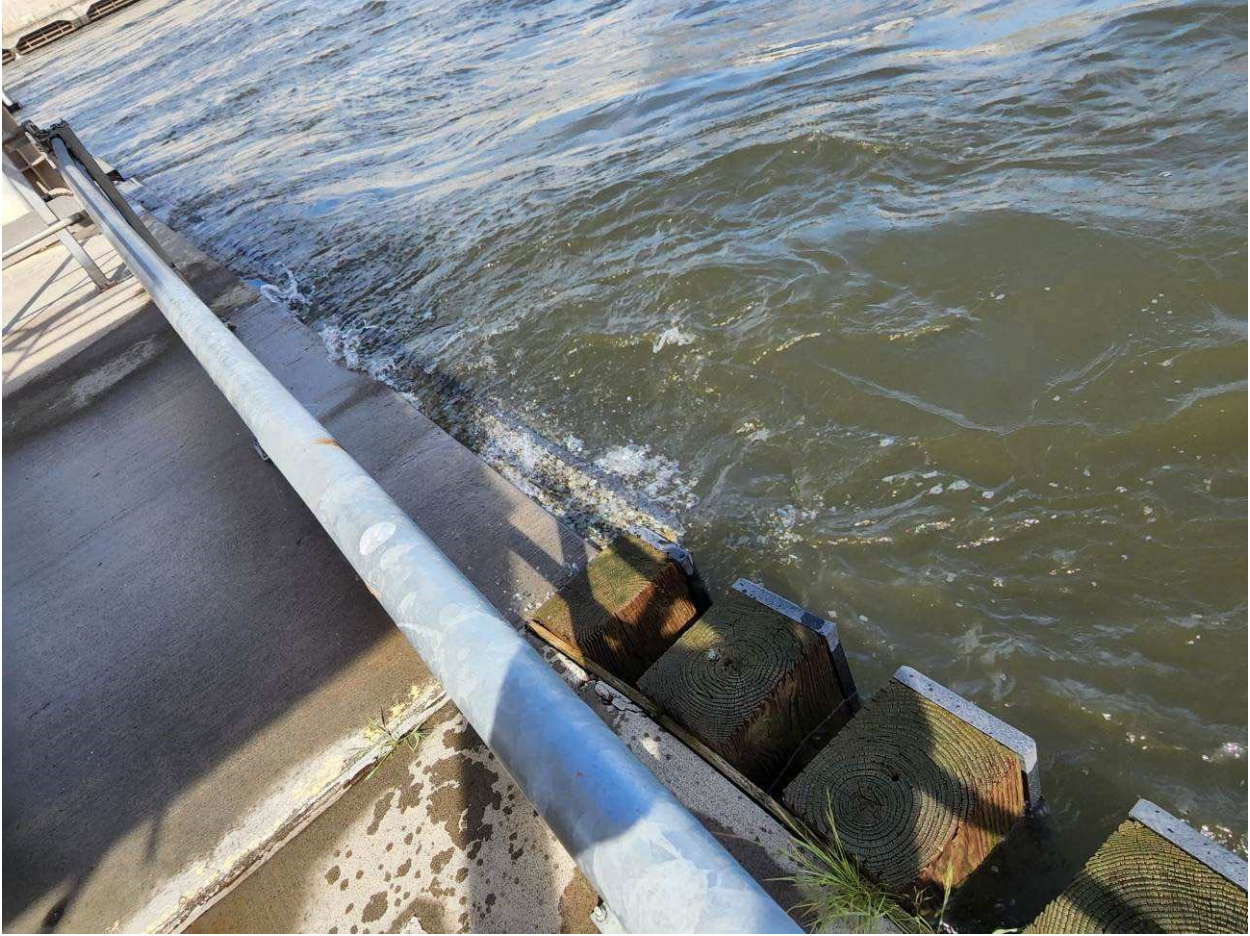
Image 1. Water level at Lower Monumental Dam barge dock on June 7, 2022.